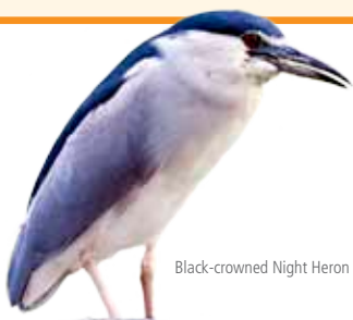
Black-crowned Night Heron