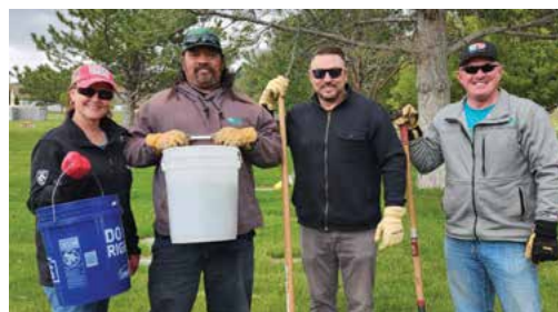
Trimming and edging to get Restlawn Cemetery in Pocatello ready for Memorial Day.