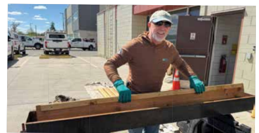
Helping build 20 beds for Sleep in Heavenly Peace in Twin Falls.