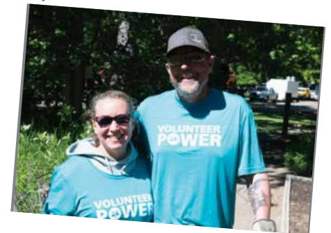
Beautifying the grounds at the MK Nature Center in Boise.