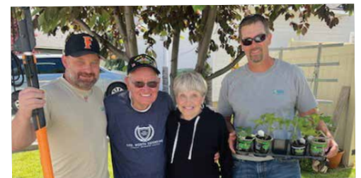
Cleaning up the yard of a local veteran in Fruitland.

To learn more about how Idaho Power gives back to our communities through donations, volunteerism, and education, visit idahopower.com/community .