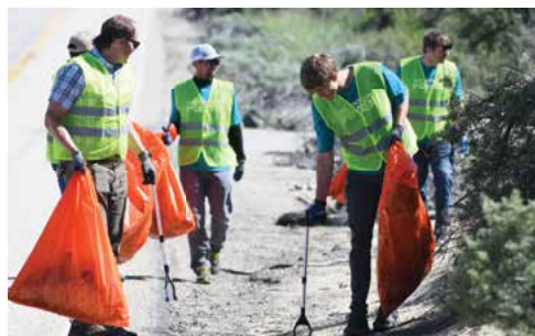
Picking up trash along our Adopt a Highway stretch of Bogus Basin Road in Boise.

In 2022, Idaho Power established a tradition called "Power of Community Day," which gives employees a chance to come together for volunteer service projects across our service area. Dozens of employees and family members came out to enjoy the most recent festivities. Here's a look at the projects we tackled during Spring 2024 Power of Community Day.