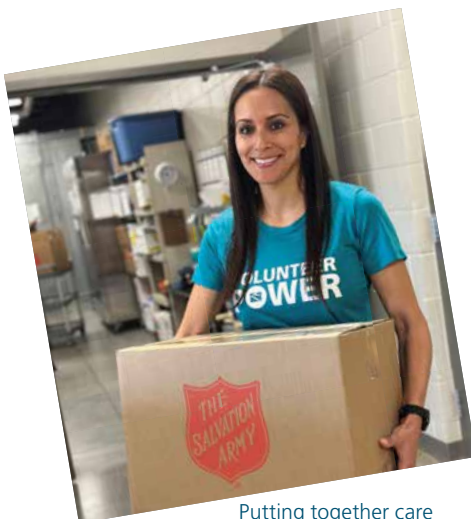
Putting together care boxes for The Salvation Army in Boise.