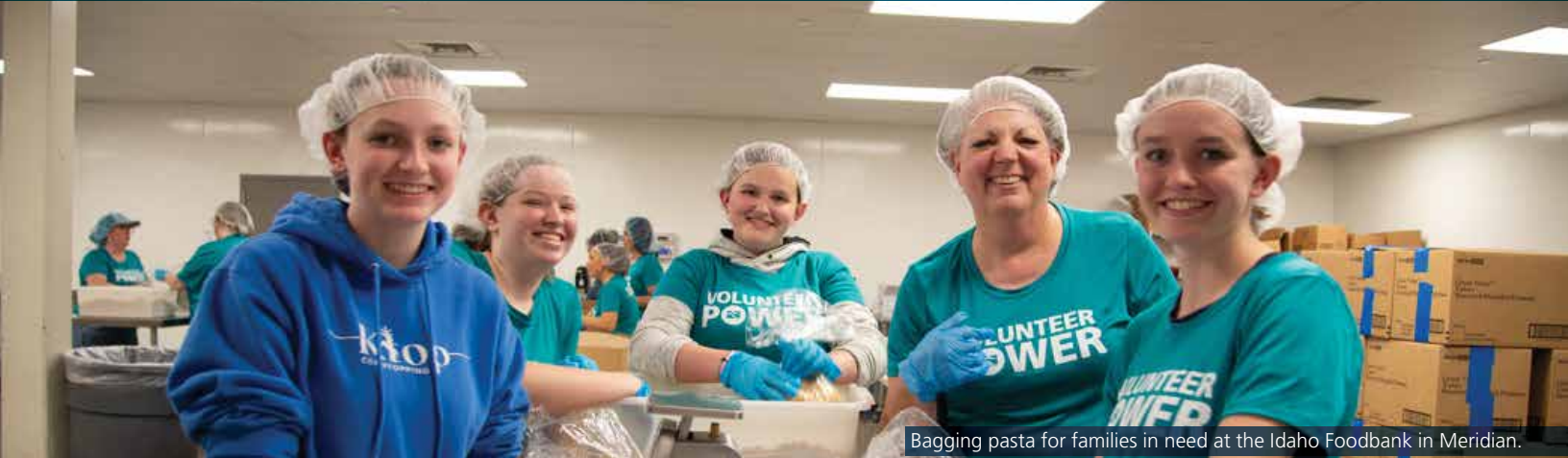
Bagging pasta for families in need at the Idaho Foodbank in Meridian.