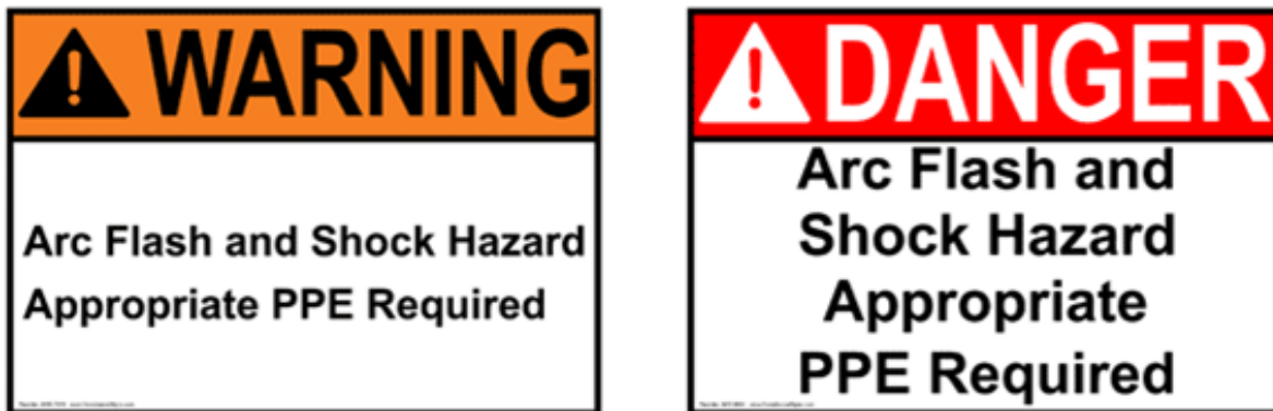
Figure 2.2. Example Arc Flash Hazard Warning Labels